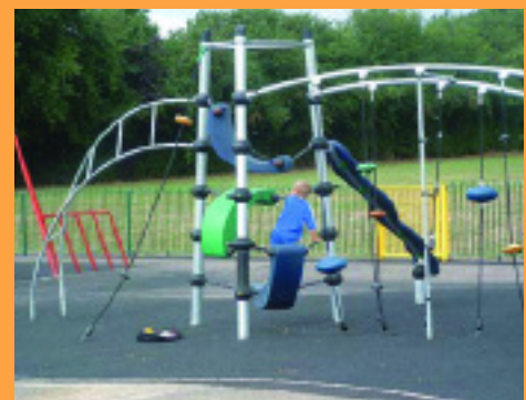
New play equipment, Peartree Park, Stevenage