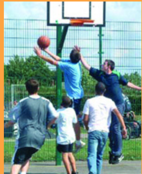
Sports facility for Peartree Park, Stevenage