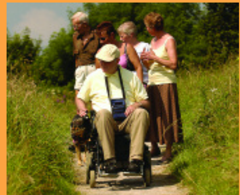
Groundwork can improve disabled access routes